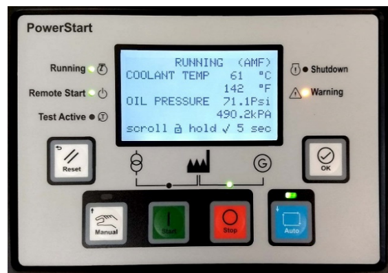
PowerStart 600 control operator/Display

Note: Please, refer to PS0600 product literature for additional Information on Control System.