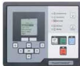
PowerCommand 1.2 control operator / display panel